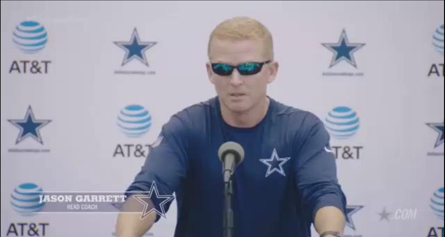
JASON GARRETT HEAD COACH